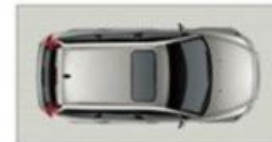
SECURITY CAR SPACE 5.1 x 2.6